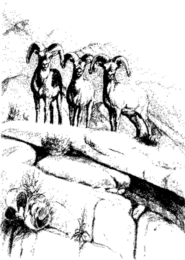
Bighorn Sheep ( Ovis canadensis ) are found in the desert mountains of Baja California. Illustration by Hans J. Peeters from California Mammals (UC Press, 1988).

Also, the RPV City Council has at long last taken its own first proactive step for open space preservation. The local land conservancy has convinced the City Council to pass a resolution in favor of acquiring all the land in an area critical to NCCP success, establishing a policy of great symbolic value. This resolution by the City Council follows on the heels of its complete outrage over the plowing under of stands of coastal sage scrub in the future preserve area by one of the developers. Although probably not illegal, the wanton destruction of habitat may have been the wake-up call the City has always seemed to need.