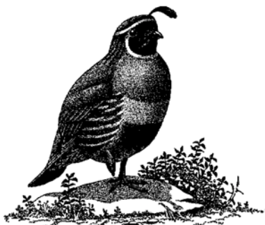
Illustration by Rudolph Freund from The Desert Year by Joseph Wood Krutch (William Sloane Associates, 1951).

After months of complex legal tangling and an appeal filed by the County of Riverside, EHL has prevailed in its action to require surveys for the endangered quino checkerspot butterfly. The County had tried to exempt applicants for building permits from assessing potential impacts. Without such surveys, the U.S. Fish and Wildlife Service would have no way of knowing whether take of this endangered species would occur. EHL was represented by Johnson and Sedlack in this case.