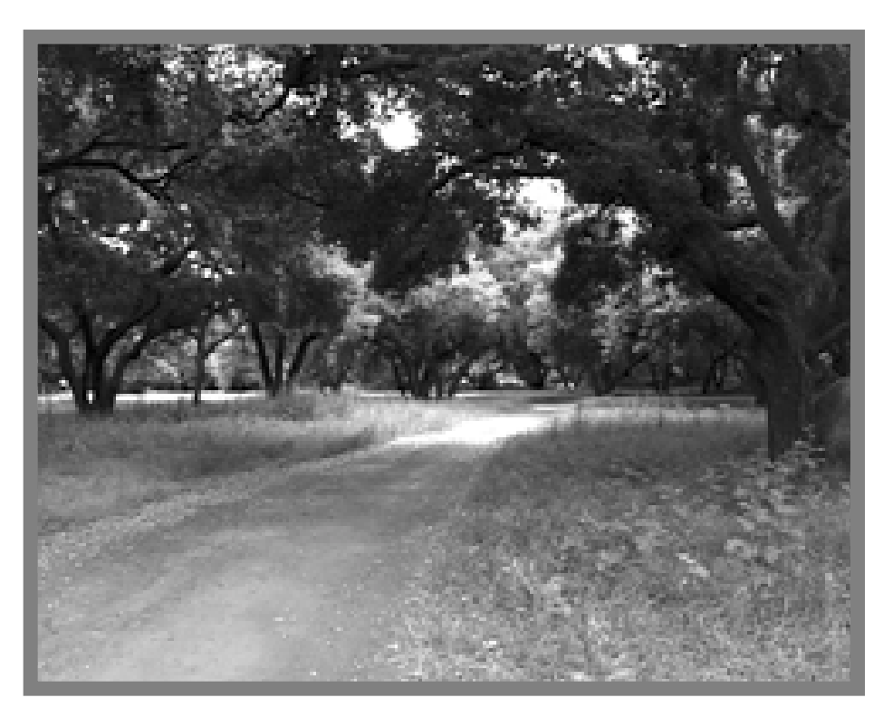
EHL's Earth Discovery Institute will include a nature center, research field station and education programs. Crestridge will also become a model for the development of environmental education, community involvement, and sustainable building design. "Green" structures will be integrated into the landscape.

The preservation of Crestridge has been a high priority for EHL and due in large measure to our efforts, became an MSCP acquisition several years ago just ahead of the proposed development of a 92-lot subdivision. As a primary and strategic objective