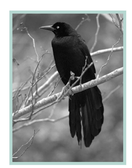
Great-tailed grackle: Can this recent avian interloper be called "native?"

Everyone who reads these pages is already familiar with the wildlife-associated problems of habitat loss and the resultant range contraction of many native species. What may not be so evident is that other native species have done well by human-induced changes to the environment. Some like the mourning cloak butterfly and house finch are so much a part of our world