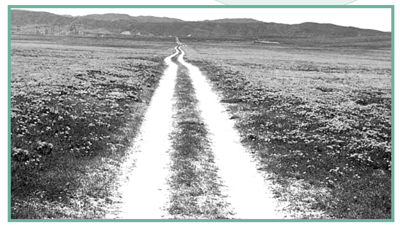
Wildflowers and California Poppies in the Antelope Valley between Gorman and Palmdale... Head inland, away from the southern coast, to California's rolling hills, interior valleys and deserts... between March and June, they are awash in colors of every hue and shade... Nothing quite outshines the golden fields of California's state flower, that native Americans said warmed the hills and drove out winter's chill... We know (it) today as the California Golden Poppy!