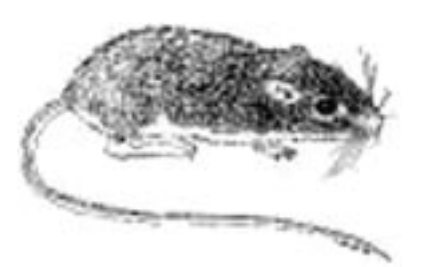
further negotiations en-

Ten years ago, due to political pressure, the Orange County Central/Coastal NCCP effectively wrote off the critically endangered Pacific pocket mouse and other natural resources on the