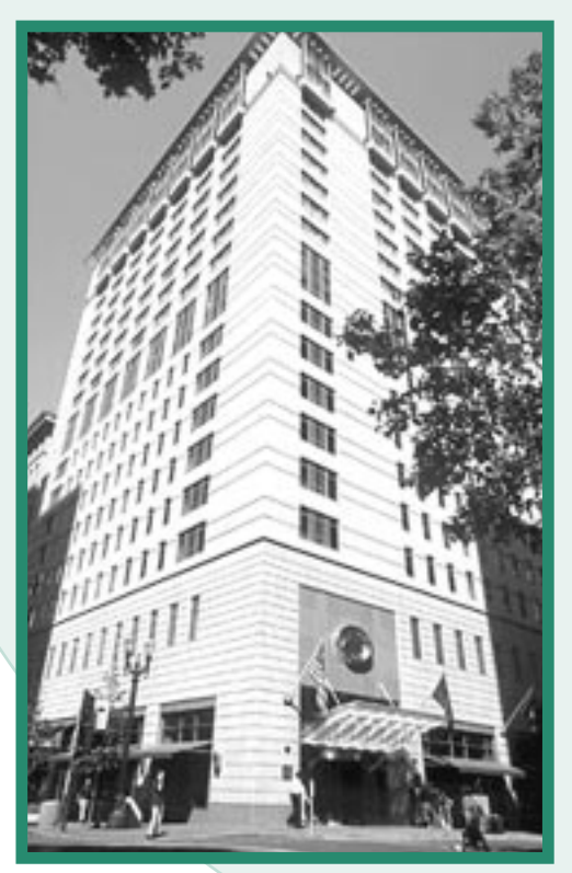
Hilton Portland & Executive Tower Hotel

✓ The program will include a dynamic mix of keynote addresses, implementation workshops, and breakout sessions, as well as opportunities for participants to network.