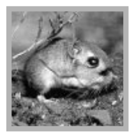
Stephens' kangaroo rat

In the wake of a divisive single species plan for the Stephens' kangaroo rat, stakeholders negotiated a "Planning Agreement" for the MSHCP. The agreement called for species recovery, landowner incentives, and a Scientific Review Panel from UC Riverside.